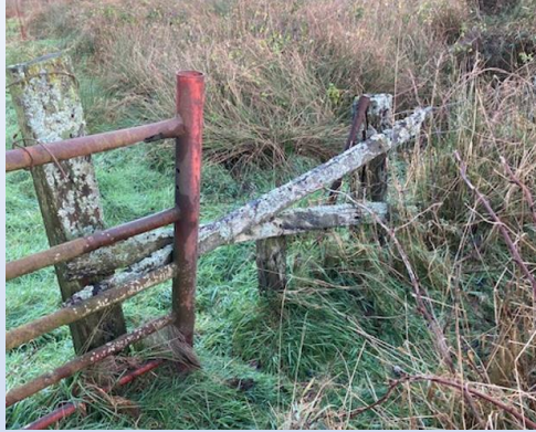
Mire House / Quakers Hole Boundary