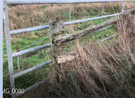
Pony field / Willow Boundary