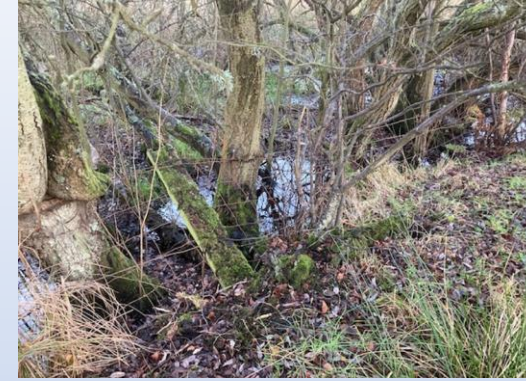
Moss House track